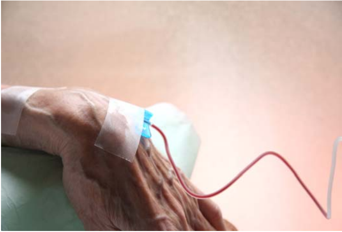
Digital print, Montse Carreño. transfusion.me/casos de altruismo extremo, 2008