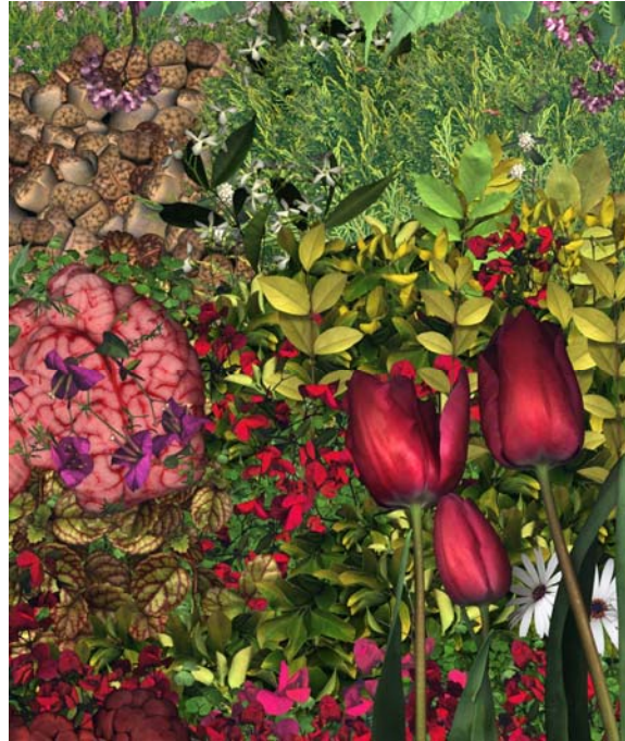
Image: El jardí de les depulles , 2002